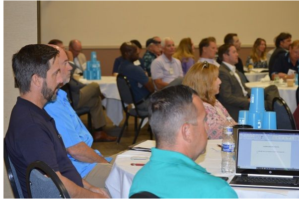
Economic Development Forum Thank you to sponsor McLeod Health