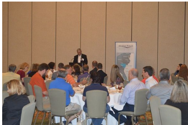
Fall Social Thank you to sponsor Bank of America