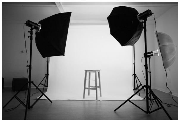
Lunch Break Headshots